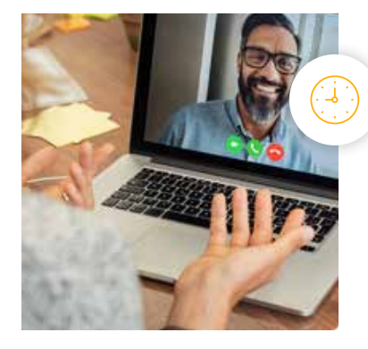
Estimated Time : 3 Months at 10 hours / week