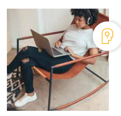
Flexible Learning: Self-paced, so you can learn on the schedule that works best for you.